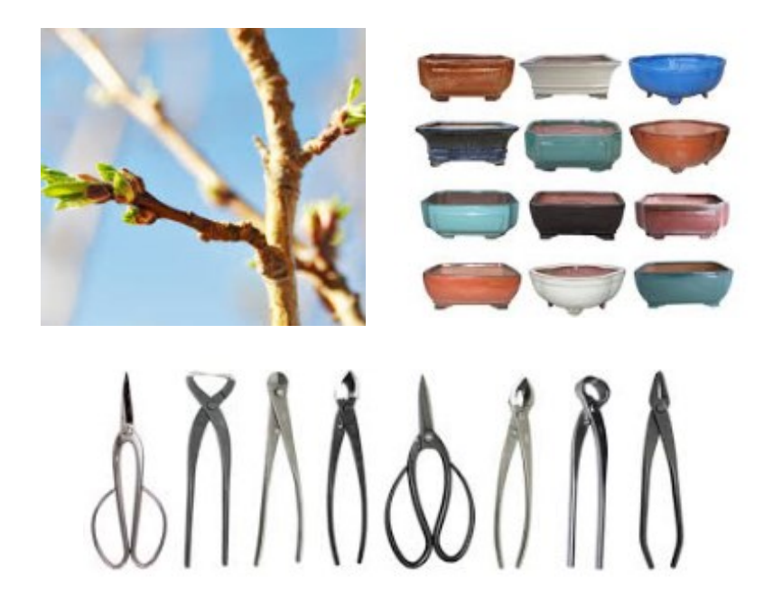
All at readiness With budding trees, pots and tools The season begins ~Joe N