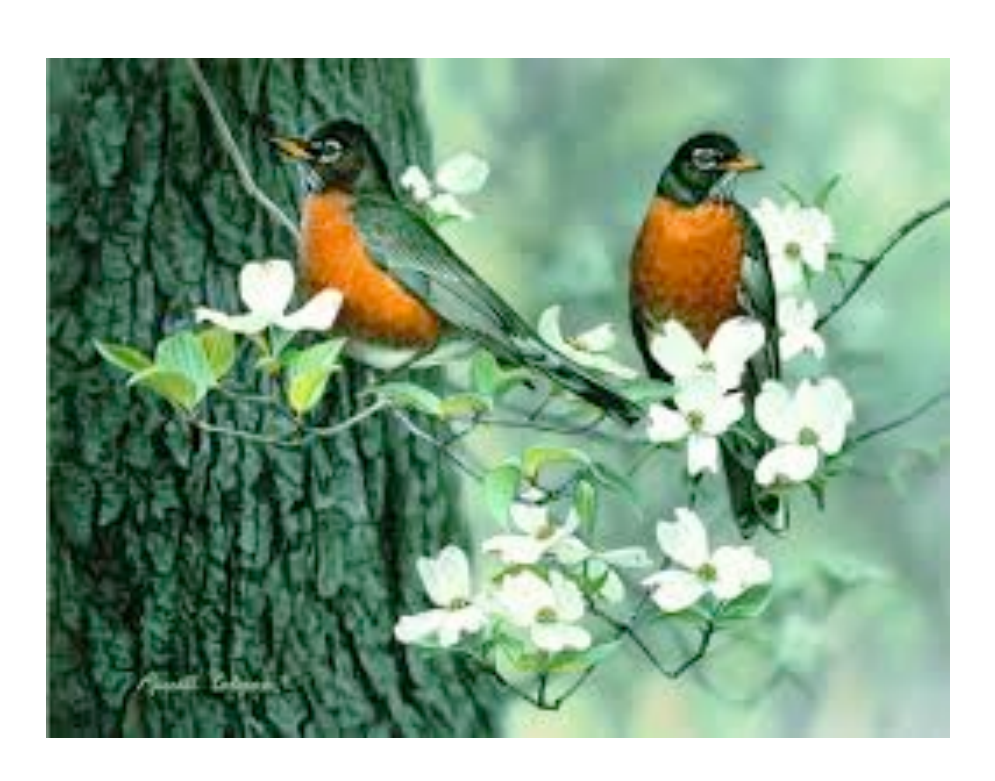
Robins returning with other heralds of spring and their cheery songs