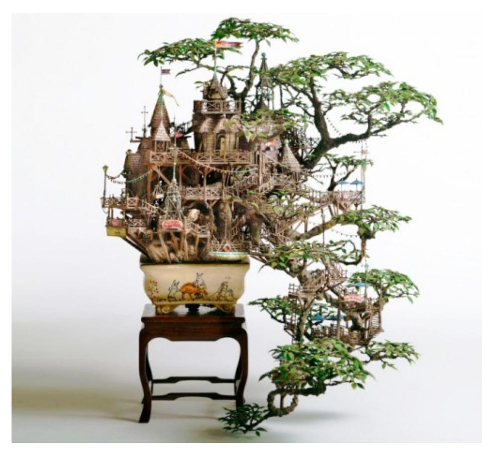
JUST FOR FUN!!