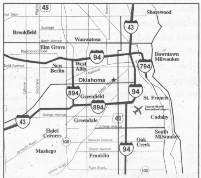
Grace Lutheran Church is located just west of St. Luke's Medical Center on the north side of Oklahoma Avenue.